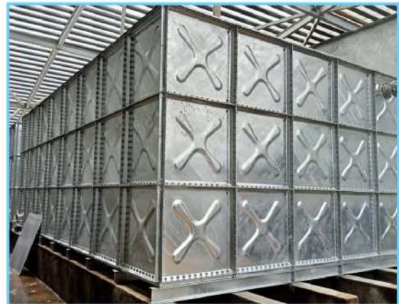
STAINLESS STEEL SECTIONAL WATER TANKS