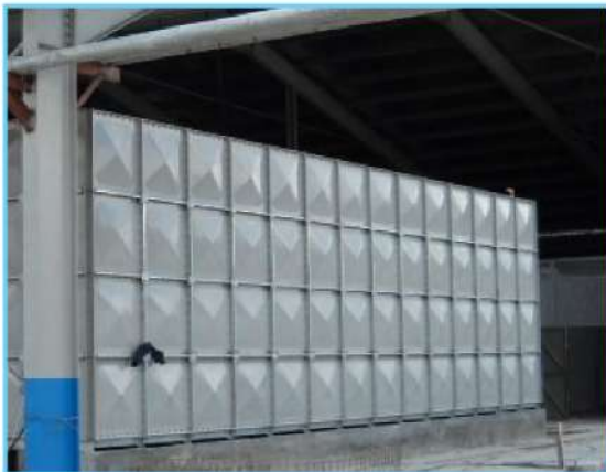
HOT DIPPED GALVANIZED SECTIONAL WATER TANKS